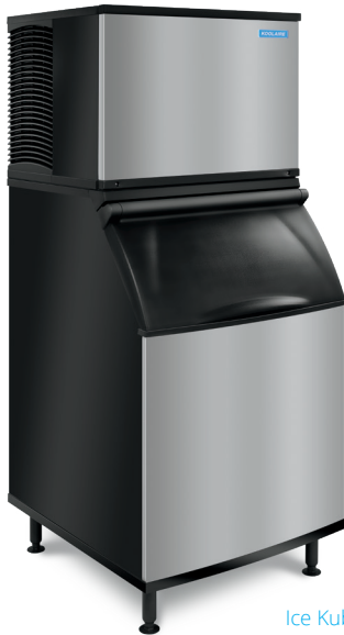
Koolaire KT-0700 Ice Kube Machine on K570 Bin

Koolaire by Manitowoc ice machines are designed, developed and tested by Manitowoc engineers to provide great ice production, energy efficiency and reliable service at an affordable price.